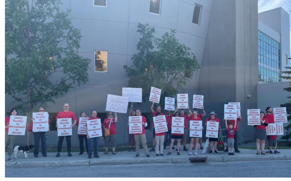
UAA faculty rallied during the June 2022 BOR meeting